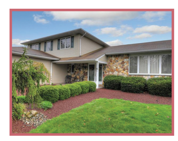
Located in Hamilton, New Jersey, The Thomas Jerome House offers a variety of modern amenities in a beautiful suburban setting.